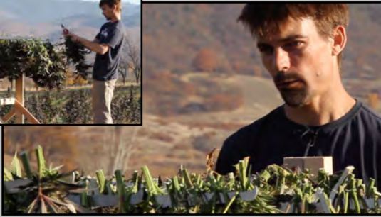
STEP 1: CUT YOUR CROPS AND STUFF YOUR J-HANGERS