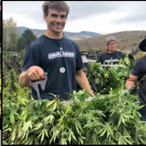
STEP 2: TRANSPORT AND EASILY ORGANIZE YOUR J-HANGERS